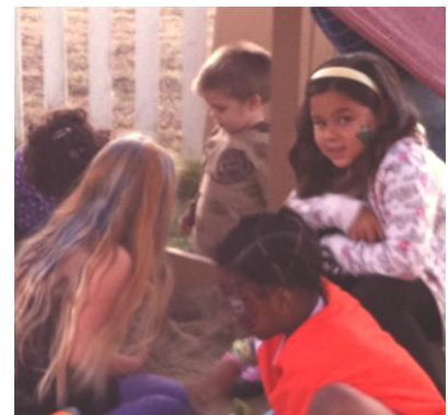
sandbox fun on Neighborhood Fun Day